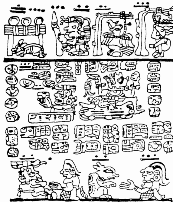
This is a page from the Madrid Codex, one of the few remaining samples of Mayan writing.

Spanish conquerors found great collections of Mayan books, but according to the beliefs of the Spanish, Mayan books were evil, so the conquerors destroyed most of them. Only three complete Mayan books survive today. They are located in museums in Europe. Only fragments of other Mayan books remain.